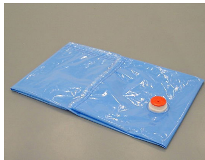
Easy fit disposable inner liner