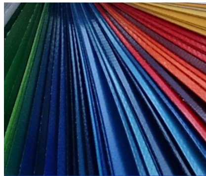
A wide range of outer bag colours